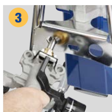
Use frame hex fitting to loosen pump and remove cartridge