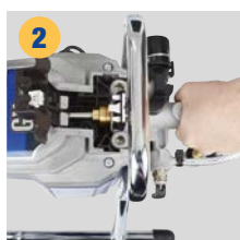
Remove pump section